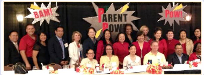
18 th Annual Parent Leadership Conference, "Power Parent"

As always, the goal of this popular annual event was to inform and inspire parents to be involved in their own children's education as well as in their schools and community, in other words, to be "Power Parents!" ▶