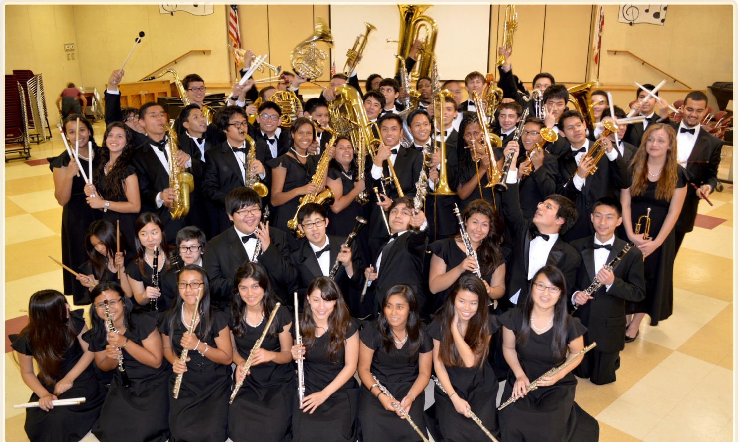
Gahr HS Concert Band at the SCSBOA Festival

On March 28 th , the Gahr HS Concert Band participated in the SCSBOA (Southern California School Band & Orchestra Association) Festival hosted at Bellflower HS and earned Unanimous Superior! This is the highest rating possible and means that all three judges gave the group a "Superior" rating! Congratulations to the students on their hard work and on this incredible achievement!! ▶