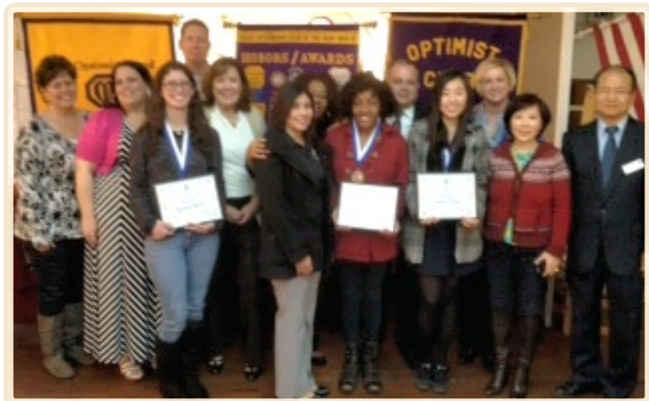
Cerritos Optimist Club Members, Essay Winners, and District Staff

Annually, ABC Unified School District high school students are invited to participate in the Optimist International Essay Contest sponsored by the Cerritos Optimist Club. The purpose of the essay contest is to give young people room to develop their views around a central idea. In addition to the opportunity for written expression, participants have the chance to win a college scholarship.