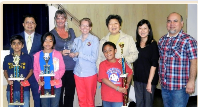
Congratulations to all our Math Bee contestants!