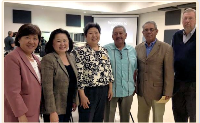
Thank you to the Board and the City of Hawaiian Gardens for being at the ABC Reading Olympics for 4-6 th graders.