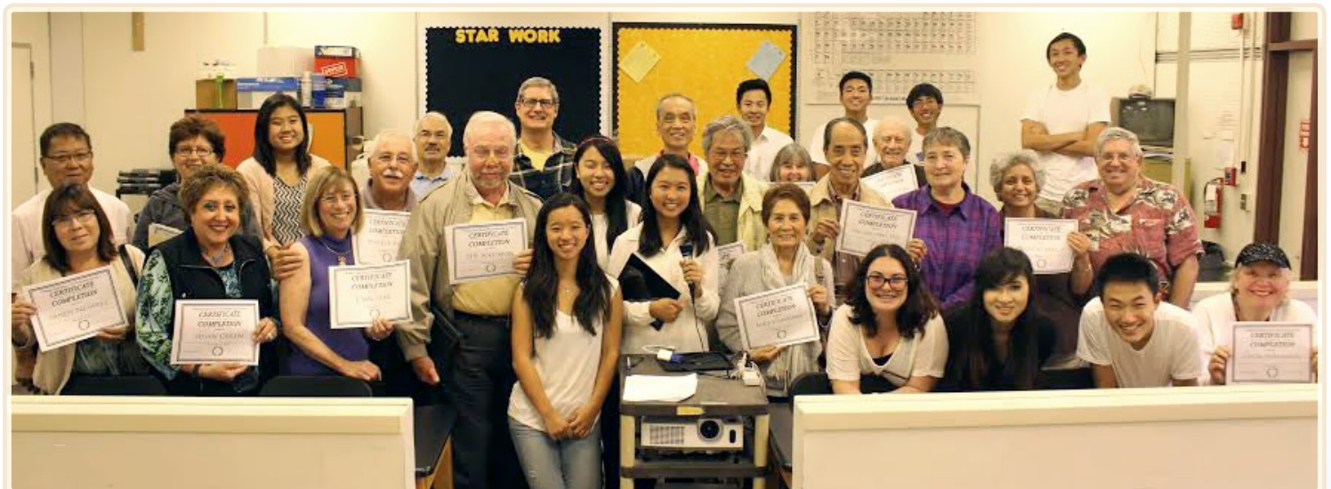
iPad Tech Team and Senior Citizen Technology Class