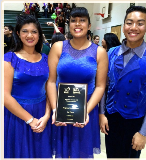
Gahr HS Winter Guard 1 st Place

The Gahr High School Winter Guard also competed at the WGASC South Hills Contest and won 1 st place in their division. ▶