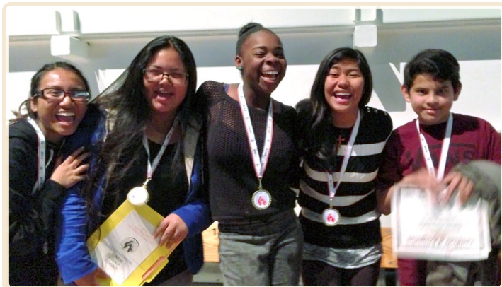
History Day L.A. Winner & State Finalist Team for "Executive Order 9066: Rights Denied Over Race"