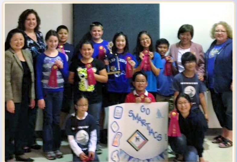
Congratulations to Kennedy ES for being the 2014 Reading Olympics Champion after competing with 5 teams from ABC.